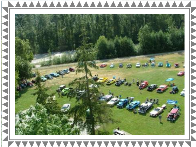
Aerial view of the beautiful setting