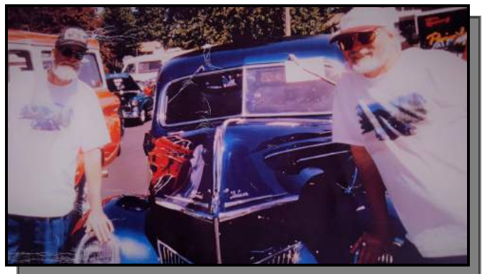
Well-Worn 2000 Terry Home Car Show Photo

And those who stop by the show can even swap stories with the Hoots, whose dream of owning classic cars that began when they were 12 has morphed into a lifetime of laughter and goodwill to all people.