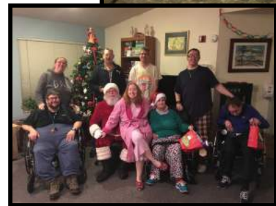
Residents enjoyed a visit from Santa at both locations