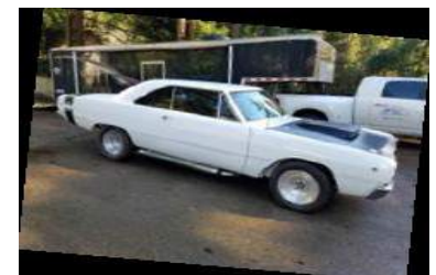
2018 Terry home car show

The 2018 Terry Home car show was a huge success! This year, the car show was sponsored by the Pro Street Car Club of Washington. They presented Terry Home with a check for $2,000. Next year's Show will be on August 17, 2019 at the Pacific City Park. Mark your calendars now.